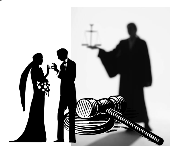
Louisiana Department of Justice Civil Division

Things You Should Know Before You Get Married!